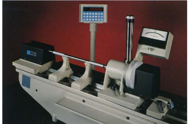
Verifying a Precision end measure length

The laser-based measuring instrument is mastered throughout its entire measuring range by inserting a calibrated gage block between the anvils, advancing the positioning head until the analog meter indicates zero, and then presetting the gage block value in the laser measurement display. The part to be measured is then placed on the elevating table between the anvils and the positioning head and advanced until the analog meter indicates zero. The absolute measurement can then be observed on the laser measurement display.