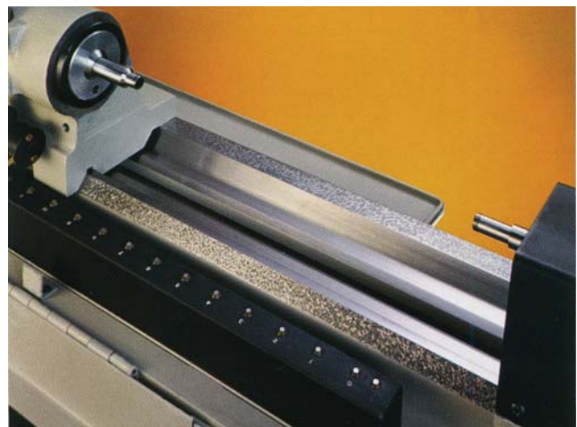
Electrolimit-Based System with Master Inch Bar