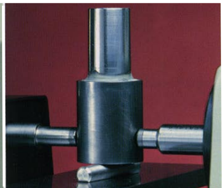
Measuring a cylindrical plug gage