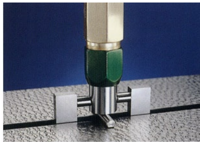
Plugs & Pins