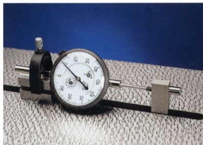
Dial & Test Indicators